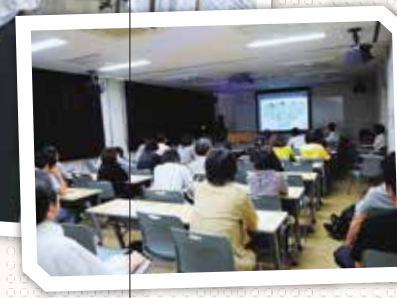
Advanced Research Seminar