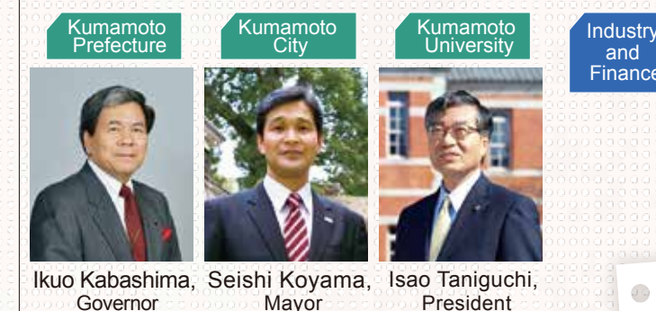
Ikuo Kabashima, Governor