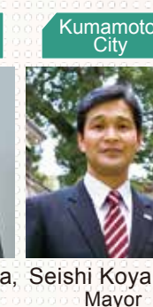
Seishi Koyama, Mayor